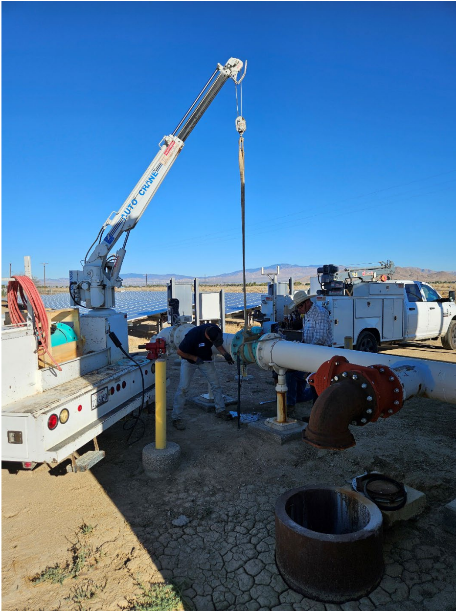
Public Works pulling the Well 9 12" flow meter