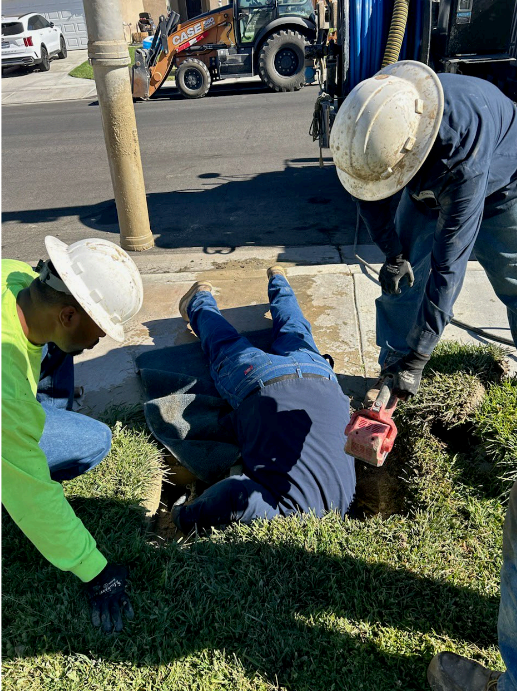
Public Works staff leaning in to fix the leaking service line