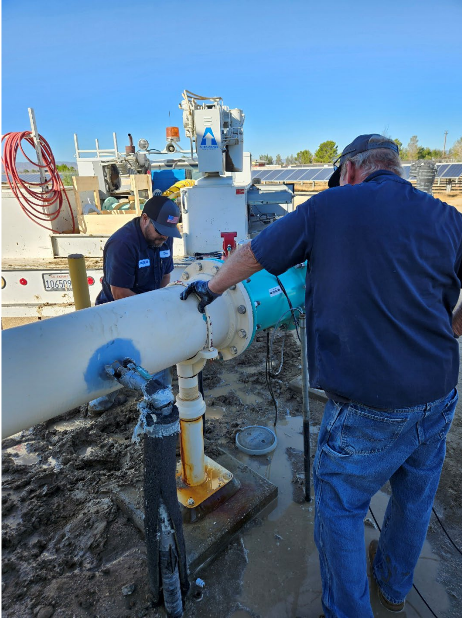
Well 9 new flow meter installed