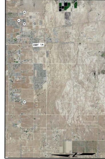
AREA MAP NIS