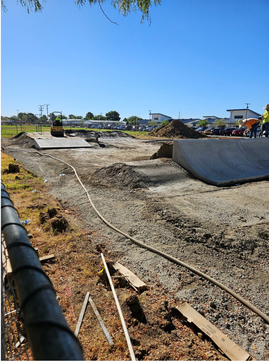
Skate park construction in progress