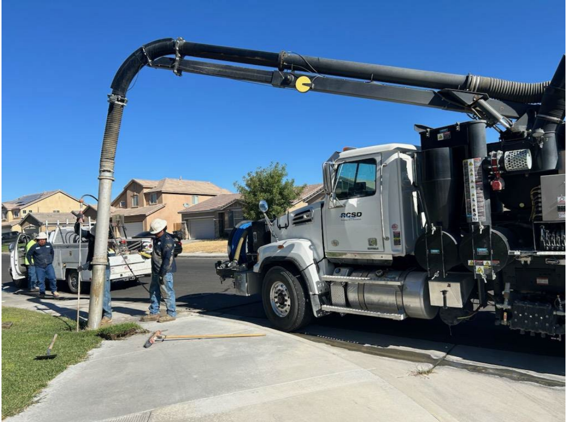
Public Works using our vacuum truck to fix a leak