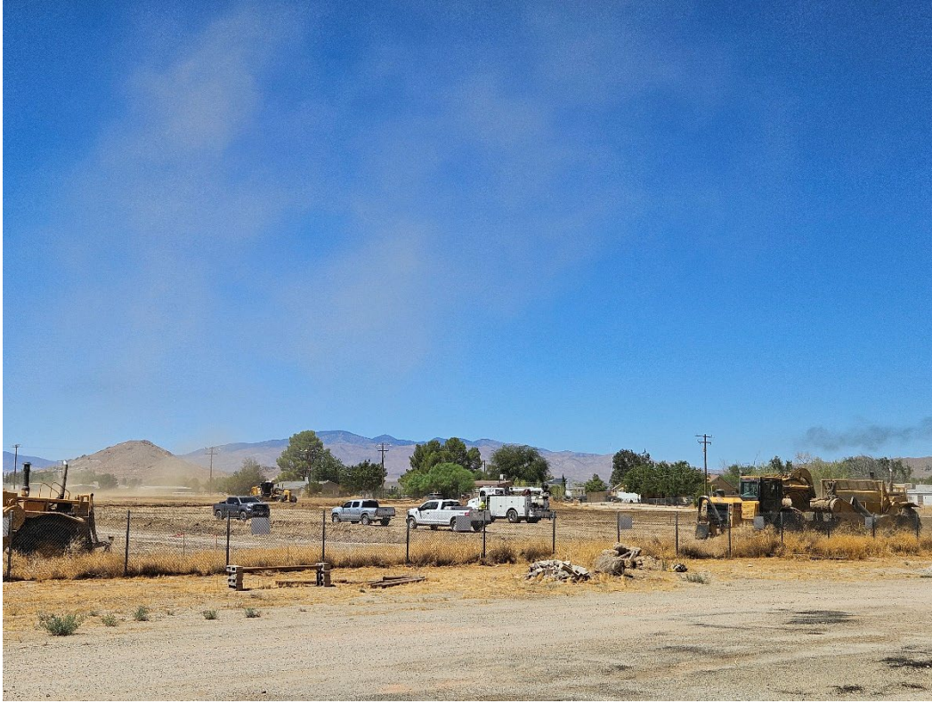
Miller construction grading the lot next to the Public Works building to prepare for the next phase of Hill view homes